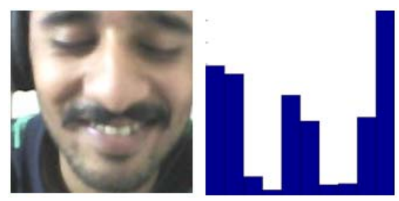
Fig 5: Image of cheerful with its Histogram