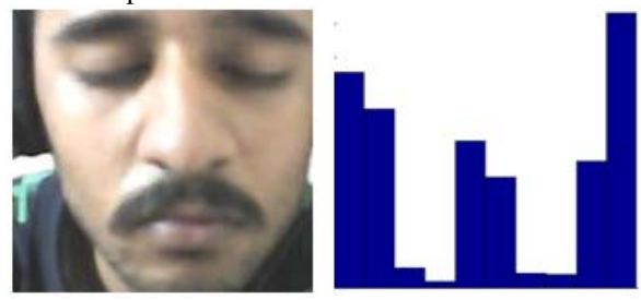
Fig 3: Image of Peace with its Histogram

expressing three or four times the five expressions. Experiments on the Students database which consists of 4 college students with age ranging from 20-23 years showed very good results. In the experiments, out of 4, 3 sequences from the student's dataset were selected for basic emotional expression recognition tests. The selection criterion was that a sequence to be labeled is one of the five basic emotions. The sequences came from 4 subjects, with one to five emotions per subject. The positions of the two eyes and Mouth in the frame of each sequence were bounded and then these positions were used to determine the facial area for the whole sequence. The whole sequence was used to extract the proposed LBP features.. The LBP based approach was shown to be robust with respect to changes in illumination and errors in face alignment. Table I shows recognition rate(%) for classical raag by subject. Following figures shows images with their respective histogram and emotional expression.