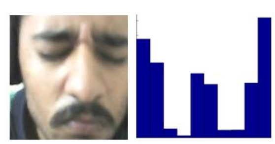
Fig 6: Image of Depressed with its Histogram