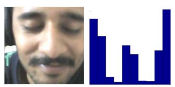
Fig 4: Image of Happiness with its Histogram